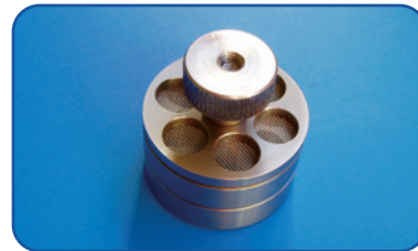
K850 sample holder

The B5222 has 12 individual specimen wells (8mm diameter x 8mm high). The compact two-level holder allows easy specimen exchange and transfer to and from the K850.