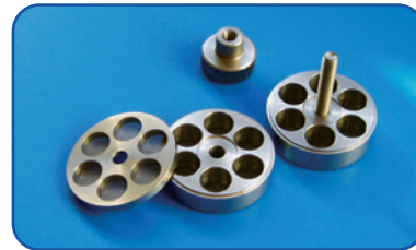
The holder has 12 sample wells