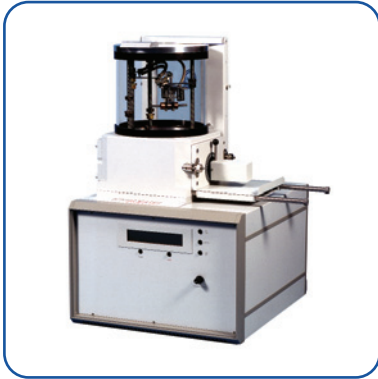
K975X turbo evaporator